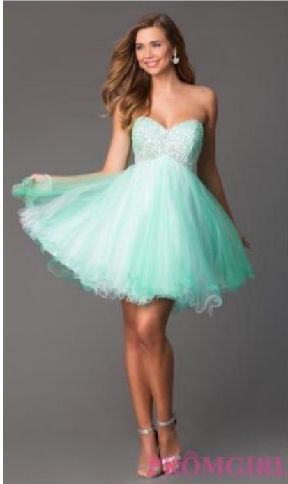
Modest shorter length