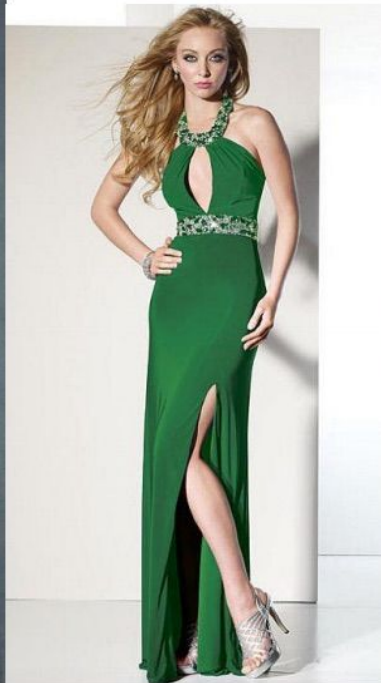
Keyhole too low