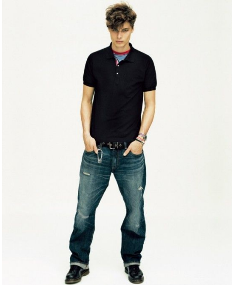
Jeans, no tie