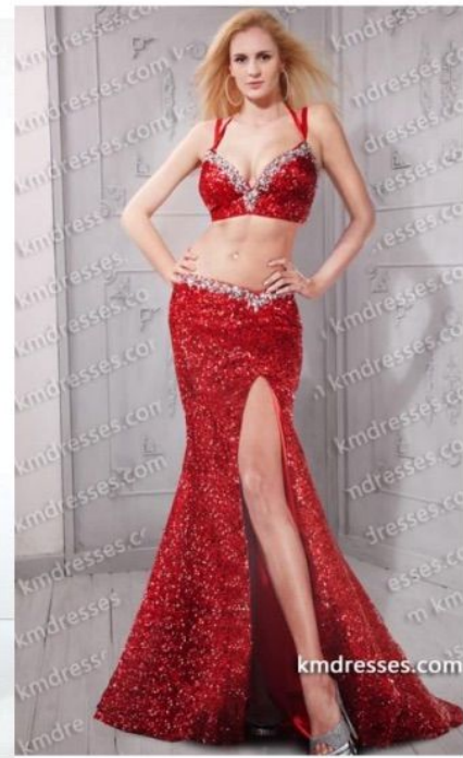
Midriff too revealing and opening by leg to high