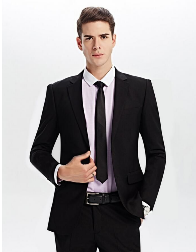
Shirt and Tie, Dress pants